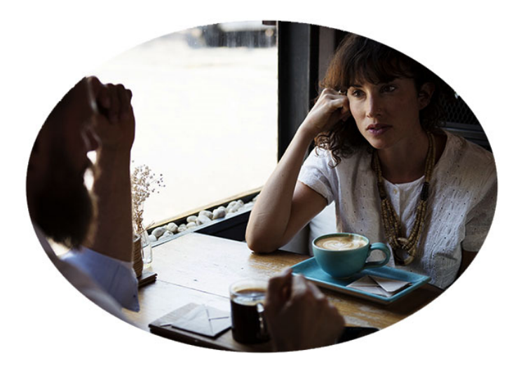
Top 10 Cybersecurity Misconceptions of SMBs

Don't feel bad if any of these sound like you. That's not the point.